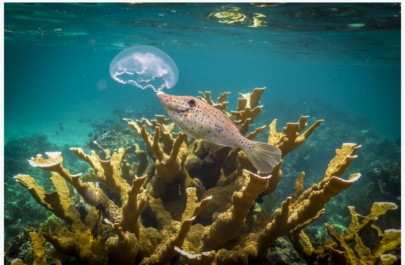
Healthy Elkhorn Coral and a Trumpet Fish in Cuba's Isle of Youth