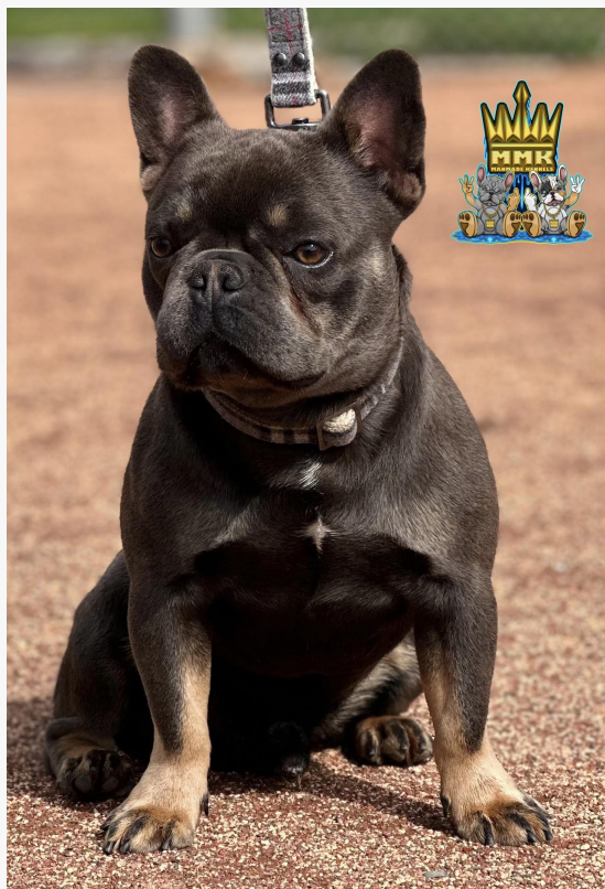
Gotham, the Rare Coco French Bulldog