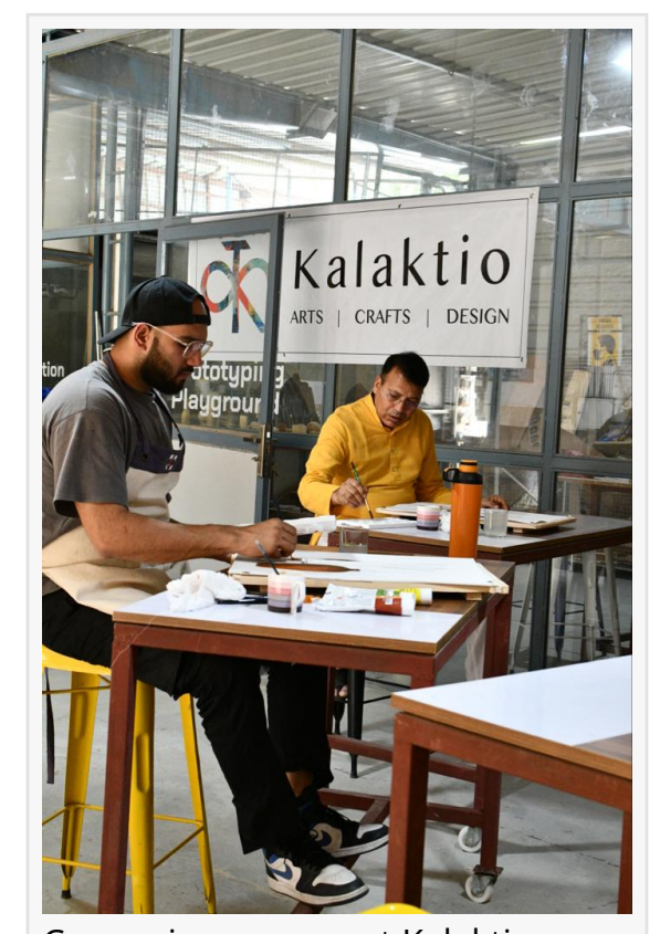
Course in progress at Kalaktio

drawing, <u>pottery</u>, <u>sculpture</u>, textile art, jewellery making, and much more. Regardless of the seeker's artistic background or experience level, there is a workshop tailored to meet all needs and aspirations.