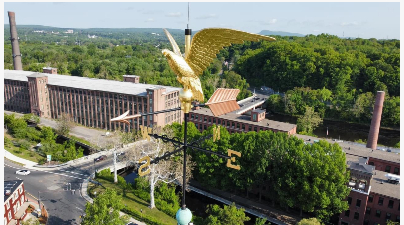
City of Chicopee, Massachusetts