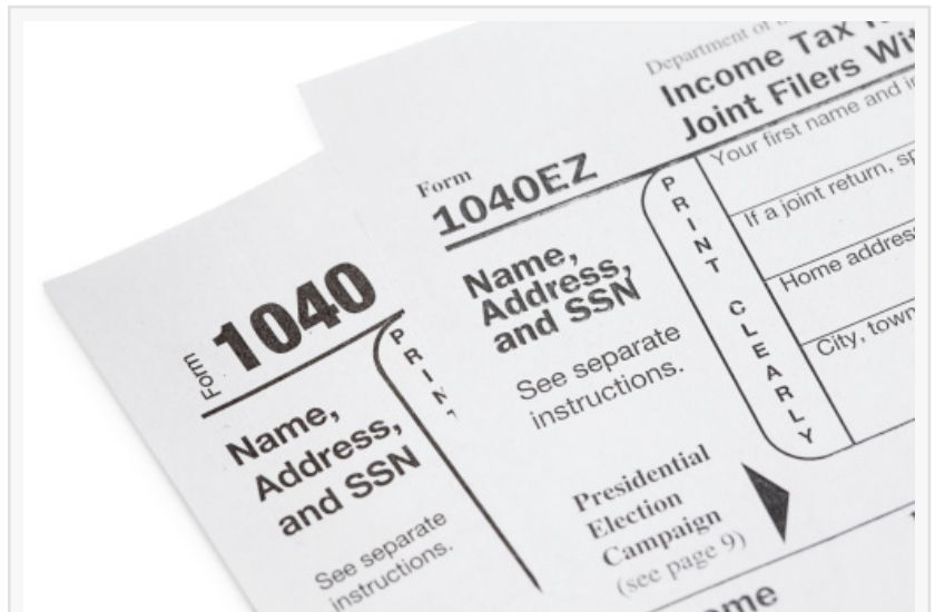
IRS 1040ez tax form

It also allows taxpayers to claim an expanded set of itemized deductions and credits. The changes are designed to help taxpayers get closer to their maximum refund while still ensuring accurate filing throughout the process.