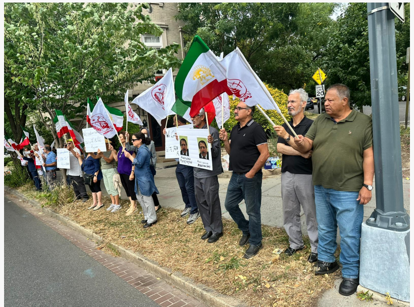
OIAC members protest outside Albanian Embassy in Washington, DC, June 20, 2023