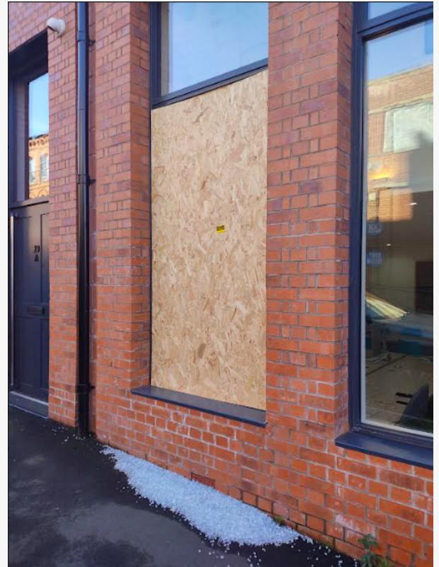
Boarded up window after break in on Tenby Street North