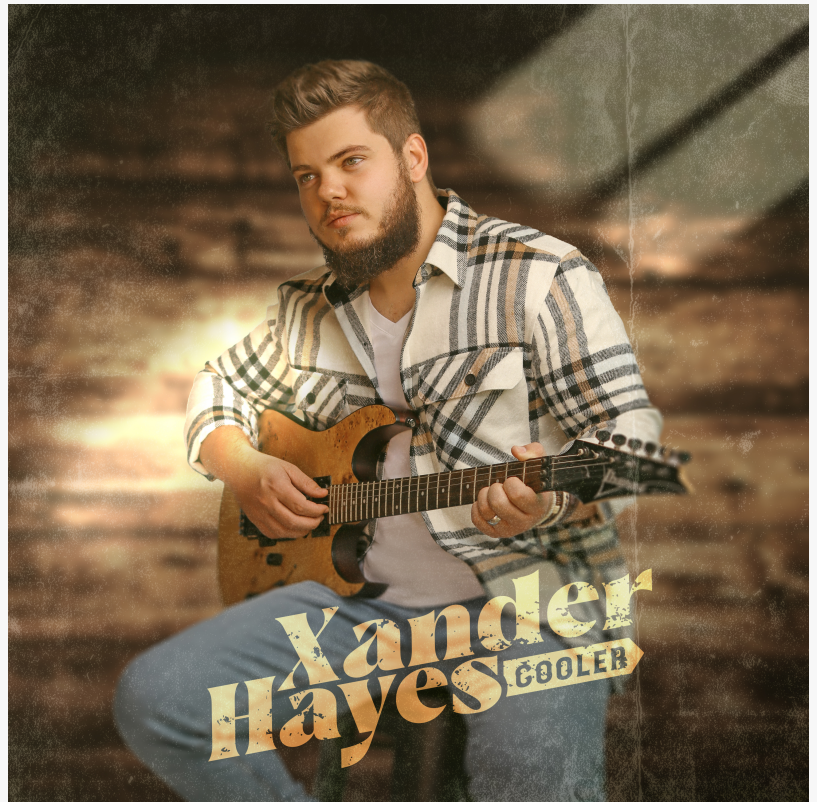
Cooler (single cover)

Cooler load it up load it up Get your cooler put the party in the truck