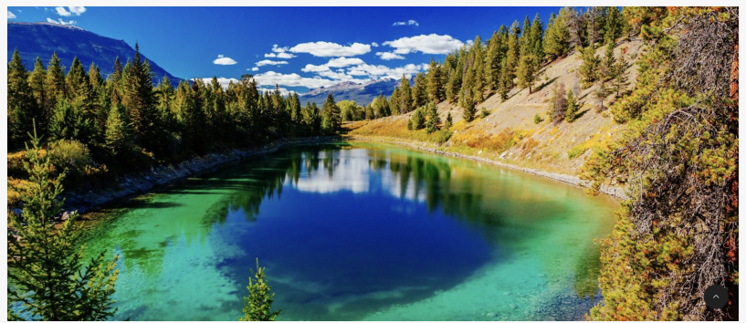
Hinton, Alberta, Canada

services to support strawberry production at the project site, including the installation of 17,530 vertical hydroponic towers, 34 polycarbonate Atlantis greenhouses, and an automated irrigation and fertilization system. Additionally, Affinor has facilitated the introduction between Freshbay and Berrymobile Fruit Distribution Inc., ensuring offtake for the strawberries grown on-site.