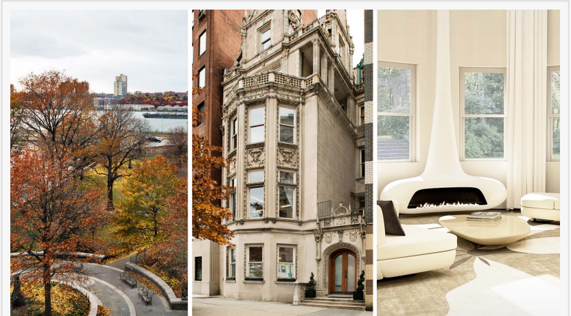
Gilded Age townhouse built by C.P.H Gilbert - All finished photos are renderings of the completed space

Steward a gem of the Gilded Age into the future. This estate, built by C.P.H. Gilbert in 1895 offers breathtaking proportions and opportunities alongside its storied history. It has a 37-foot wide footprint, up to 24-foot high ceilings and open sky views. Beginning in 2017, the current owners started an epic renovation, including the addition of an expansive 6,000-square-foot, three-floor entertaining space that, when completed, would rival the amenities of a full-service luxury