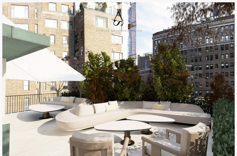
Overlooking Riverside Park at 72nd - All finished photos are renderings of the completed space