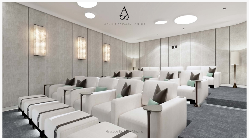
Luxurious amenities once renovations are complete - All finished photos are renderings of the completed space