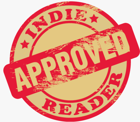
the Indie Reader Approved logo

This press release can be viewed online at: https://www.einpresswire.com/article/640571341