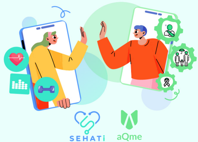
Collaboration with SEHATi healthtech app by Malaysia's SOCSO (Social Security Organisation)

The recent launch of HSP 3.0 on the SEHATi app offers all SOCSO members aged 40 and above, an upgraded health screening programme for free. Bumi Healthtech, the creator of SEHATi app works directly with Social Security Organization (SOCSO) to help users easily log health screening appointments and health data. Now, members who have conducted a health screening through Bumi Healthtech partners can access their health score and explore personalised, exclusive insurance plans through the SEHATi app. This collaboration enables an app-to-app seamless onboarding process, by taking into account a pre-underwriting process and zero form filling feature, users can sign up to life insurance plans in just three steps.