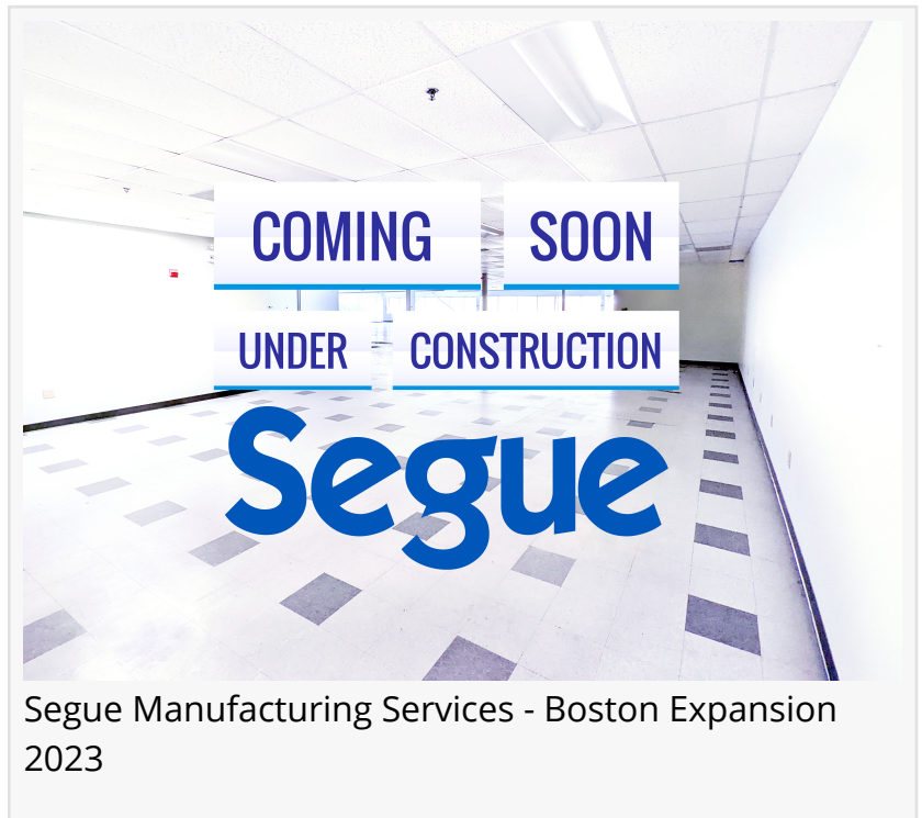
Segue Manufacturing Services - Boston Expansion 2023

employs 120 engineering, supply chain and operations specialists in complex electronics manufacturing, and features an NPI Center, complex cable assembly, and specializes in complex