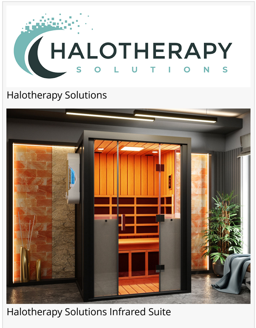
Halotherapy Solutions Infrared Suite

With concerns for mental health, aging, and self-care rising, Halotherapy Solutions suggests that moving toward salt therapy to alleviate stress and ailments is essential for every local spa. The premiere salt cabin is perfect for clients and athletes recovering from achy joints. The combination of medical-grade salt therapy, Infrared and Red Light Therapy, Chromotherapy, and Aromatherapy is a multi-modal approach designed for optimum effectiveness. The layered approach which is featured in national brands like World Gym and The DRIPBaR is a great addition to wellness facilities that want to expand services for discriminating clientele. The unit comes in 4 different sizes and is ADA compliant. One standout product is the 4-person unit which is often used for hot yoga, Pilates and meditation.