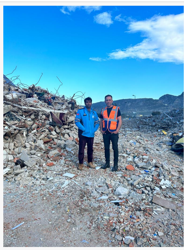
Disaster medicine in Turkey, 2023

committed to addressing the immediate needs of the affected communities and working towards long-term solutions.