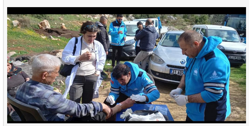
Refugee medicine in the mountains, Turkey 2023

the risk of waterborne diseases looming large.