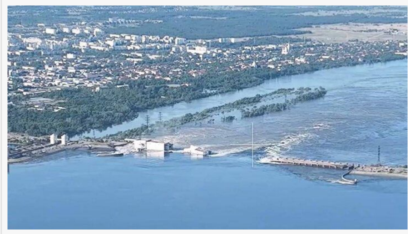
Collapse of the Nova Kakhovka dam in Ukraine's Kherson region

The Nova Kakhovka dam collapse has resulted in widespread flooding, displacing thousands of people and causing immense damage to infrastructure, homes, and agricultural lands. The sudden deluge of water has disrupted the lives of countless individuals, leaving them without shelter, clean water, and access to essential services. The environmental consequences are equally severe, with contamination of water sources and