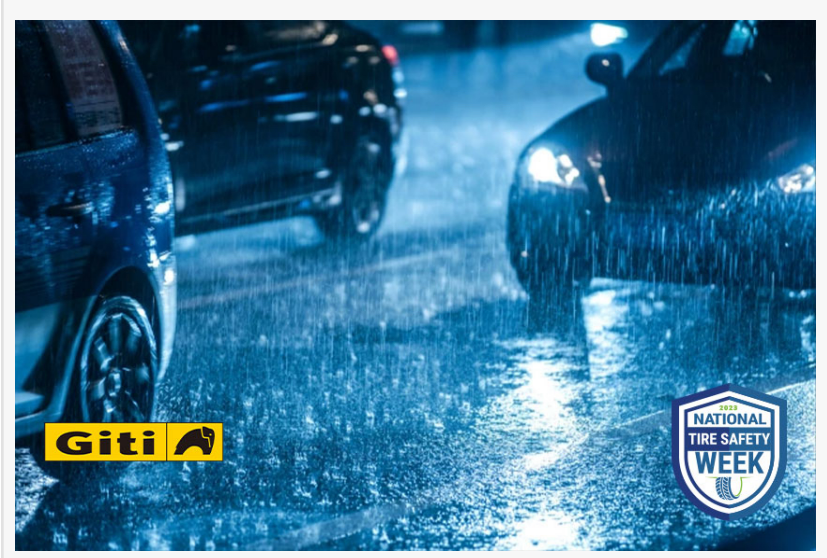
In addition to having sufficient tread depth for wet traction, remember to ease up on the gas pedal in wet weather.

Americans drove more than 3.169 trillion miles in 2022, an increase of more than 29 billion miles