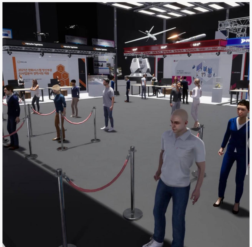
mmai PureWorld office