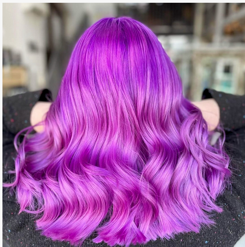
Bespoke Purple

This press release can be viewed online at: https://www.einpresswire.com/article/640923992