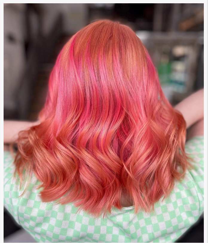
Bespoke Pink & Peach Hair Colour Melt

No matter the chosen hairstyle, protecting the hair and maintaining its integrity is vital for any hair look. Especially in summer, strong UV rays can cause the hair to become dry, brittle, and