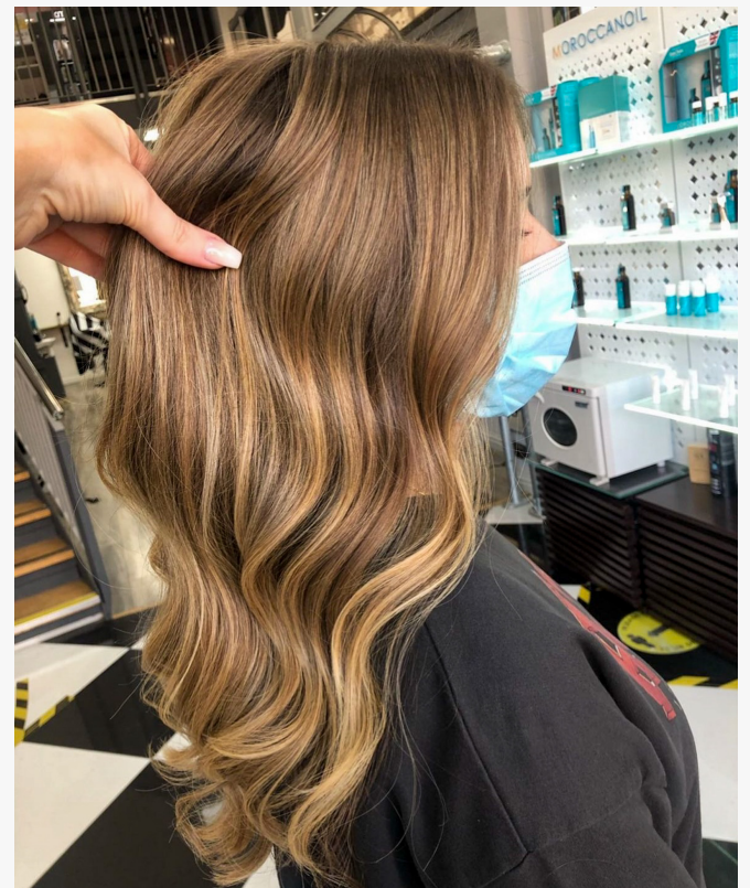
Honey Blonde Balayage