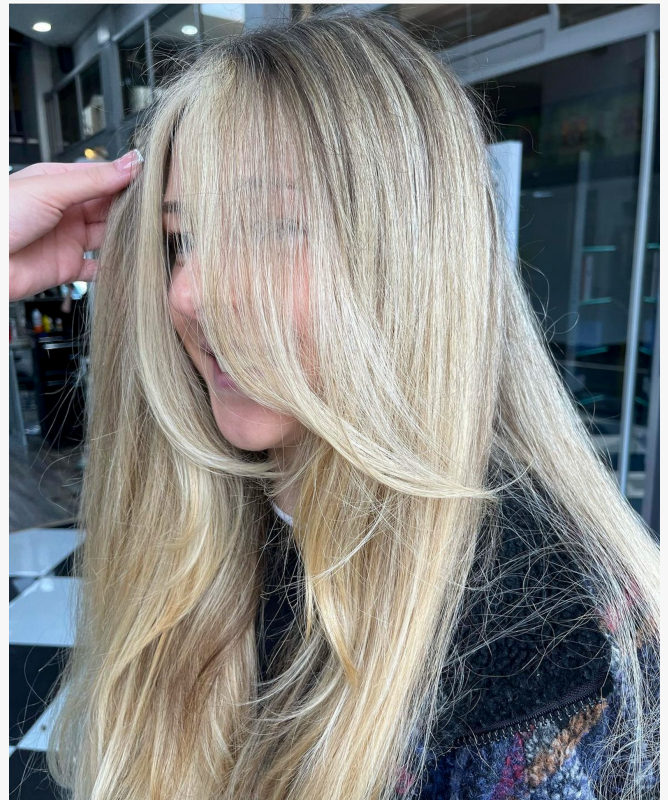
Curtain Bangs are celebrating a comeback

For a less drastic change, curtain bangs are a great option to update a hairstyle. The retro-