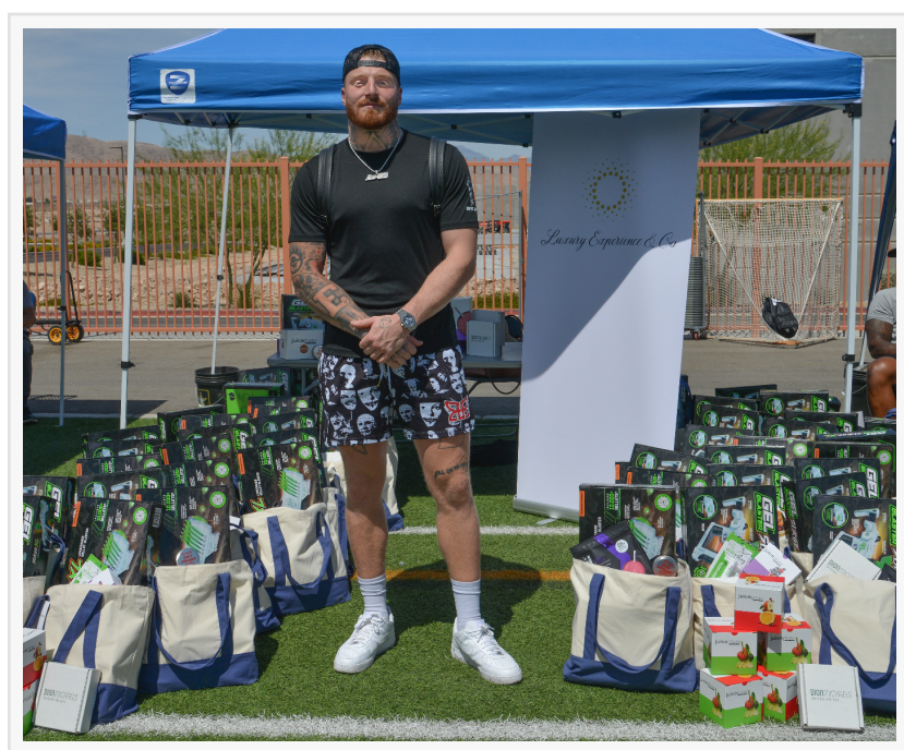
Maxx Crosby, Las Vegas Raiders

This press release can be viewed online at: https://www.einpresswire.com/article/640985581