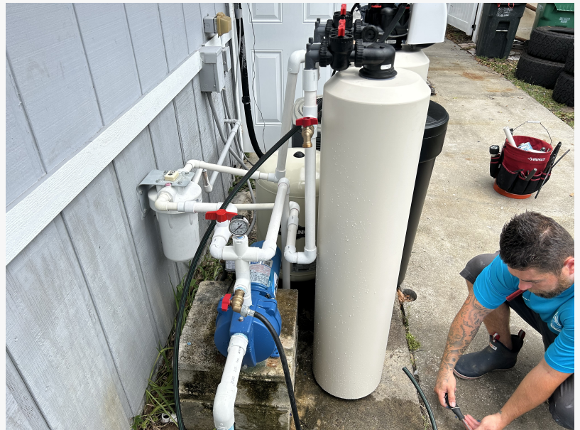
Emergency well pump swap out

The newly introduced Emergency Services by PSL Water Guy are designed to cater to a wide range of urgent water treatment needs. Whether it's a sudden water contamination issue, a malfunctioning water purification system, or any other water-related emergency, the expert team at PSL Water Guy is now equipped to provide prompt and effective solutions, ensuring the safety and well-being of their