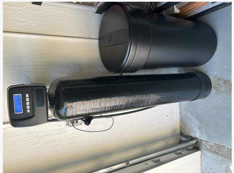
early morning emergency service setup