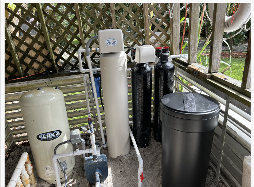
installation of pumphouse triple system

In addition to their swift response and expertise, PSL Water Guy takes pride in their commitment to exceptional customer service. The company understands that emergencies can be stressful, and their compassionate team strives to alleviate the concerns of their clients by providing clear communication, transparency, and personalized support throughout the emergency service process.