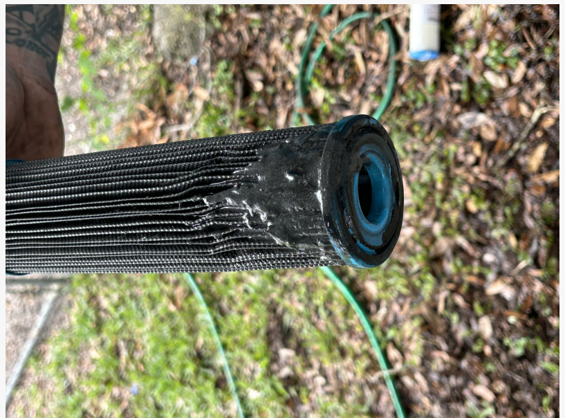
Much needed Sediment Filter exchange