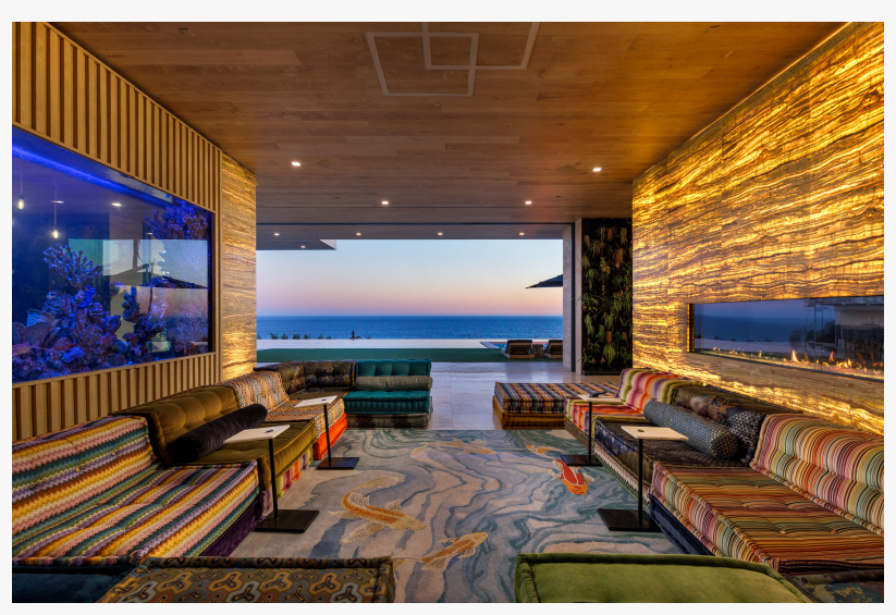
Panoramic ocean views from the infinity pool