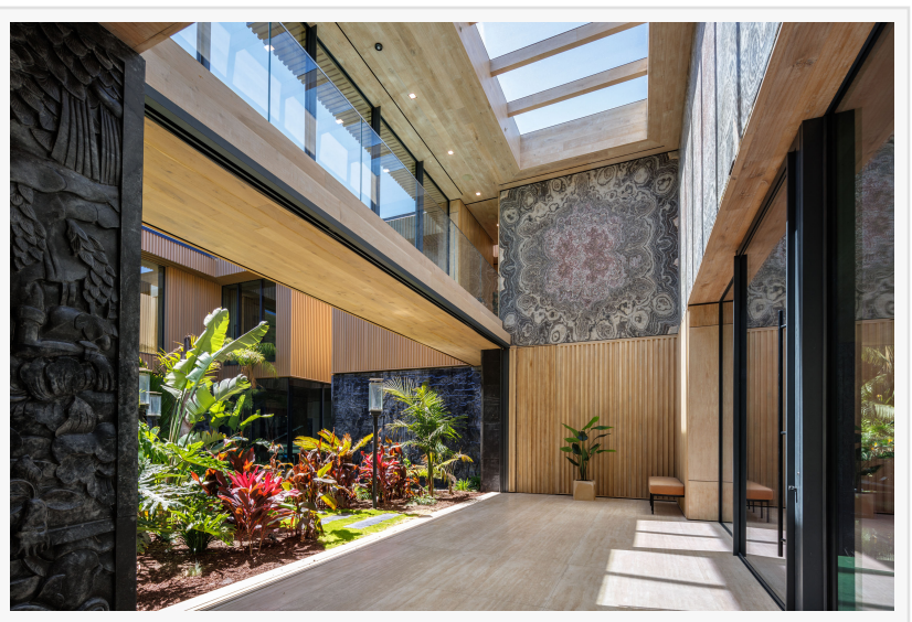
Resort-inspired living with custom-designed details

Premiere Malibu Location Malibu, renowned for its idyllic coastal beauty and exclusive neighborhoods,