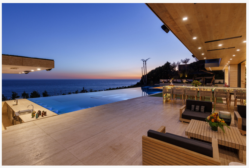
Minutes away from famed beaches & Camarillo private airport