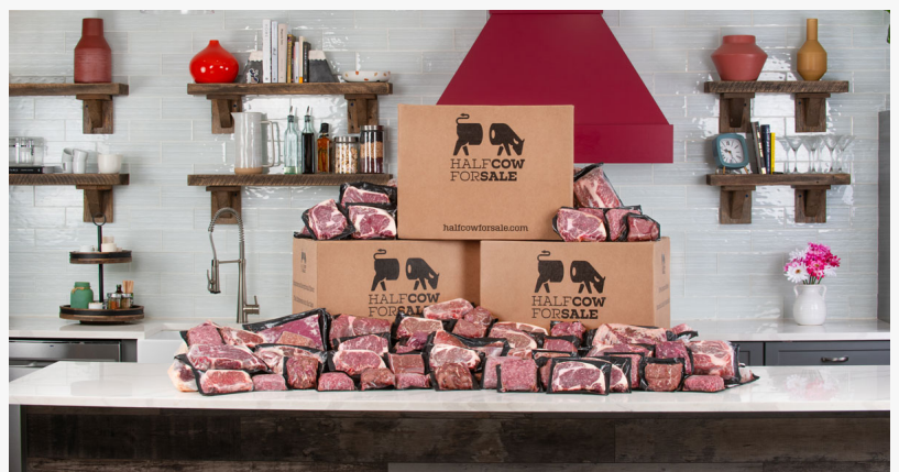
Buy Half A Cow Online

HalfCowForSale.com , the newest leader in sustainable agriculture and ethically raised beef, has unveiled an innovative online platform that allows consumers to buy half a cow online offering premium quality, farm-fresh beef directly from the source.