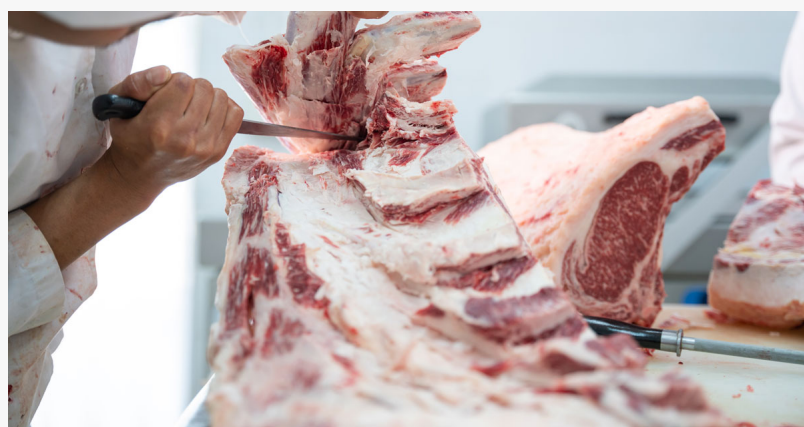
USDA Inspected Half Cow Processing

Customers can now conveniently order their premium half cow through the website, www.HalfCowForSale.com , where the platform offers a simple, streamlined shopping experience. Each purchase comes with the guarantee of exceptional customer service from a team committed to ensuring customer satisfaction at every stage. With its exceptional quality of beef, ethical farming practices, and innovative direct-to-consumer model, HalfCowForSale.com