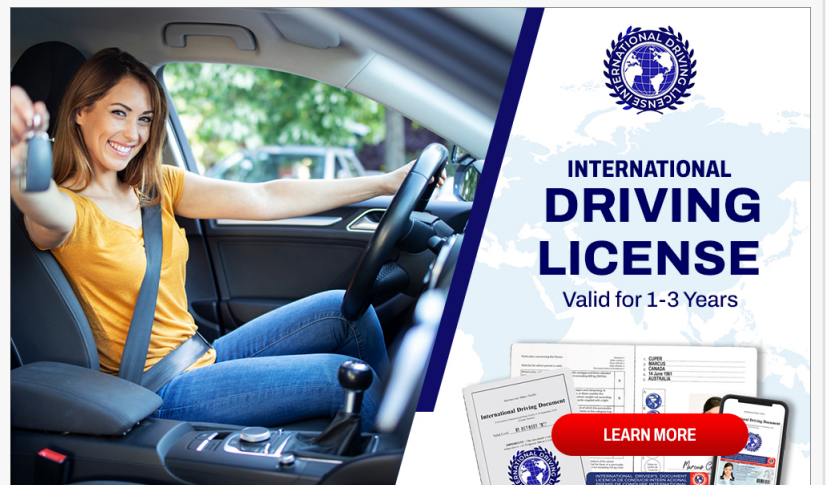
International Drivers License