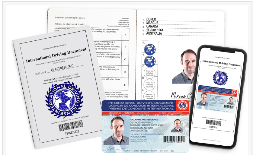
International Drivers License

For individuals looking to drive overseas, acquiring an international driving license is an essential step towards unlocking the freedom of exploring foreign destinations on their own terms. The permit grants individuals the ability to rent a car, operate a personal vehicle, or even utilize