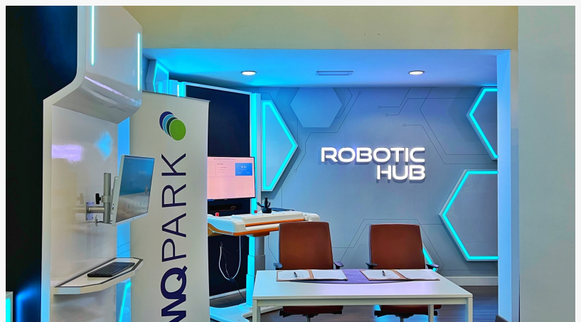
Adopting Fourier Intelligence's RehabHub™ concept, WQ Park provides various solutions for the upper and lower extremities.