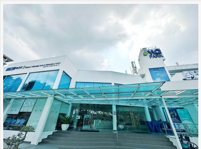
Established in 2010, WQ Park Health & Rehabilitation Centre (WQ Park) is Malaysia's first private outpatient rehabilitation facility.

The signing of the MOU marks the beginning of a promising collaboration between Fourier Intelligence & WQ Park. This partnership will strengthen and foster greater