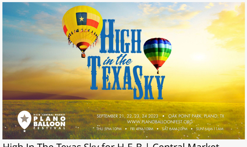
High In The Texas Sky for H-E-B | Central Market Plano Balloon Festival

High In The Texas Sky logo for H-E-B | Central Market Plano Balloon Festival