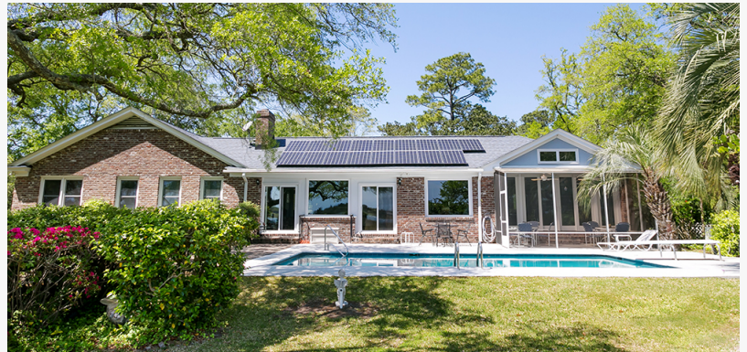
Home featuring recent installation by SuperGreen Solutions