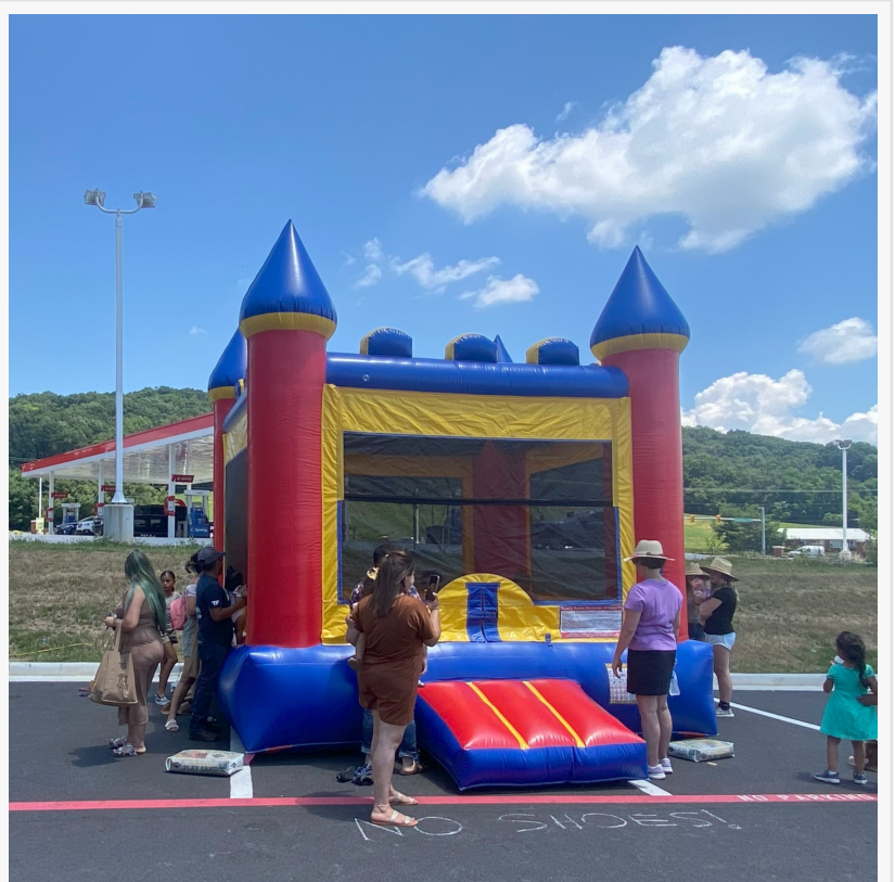
Ribbon Cutting • Lunch • Snow Cones • Bouncy House

This press release can be viewed online at: https://www.einpresswire.com/article/641608377