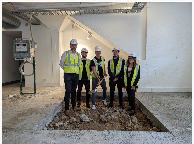
Q-CTRL breaking ground on new HQ