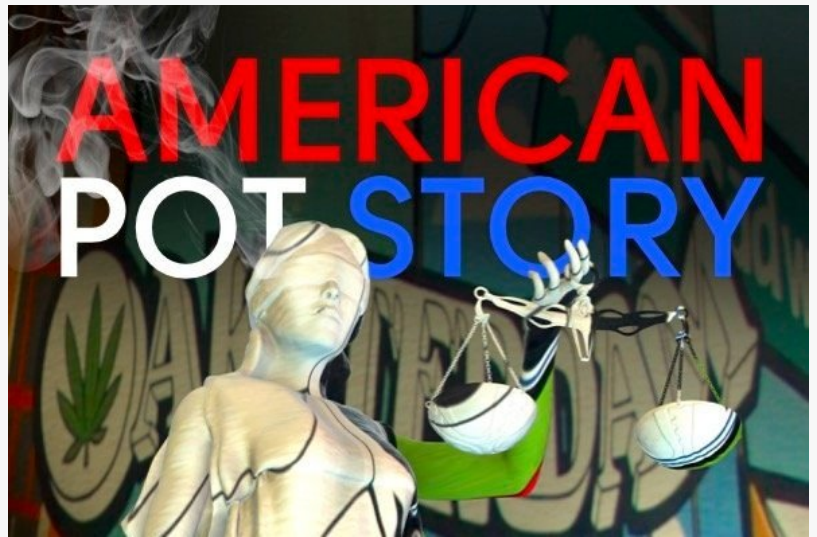
American Pot Story Official Poster

Award-Winning American Pot Story: Oaksterdam will have its Hollywood premiere during the Dances with Films Festival this Thursday, June 29, at 7 PM at the TLC Chinese Theatres, Hollywood