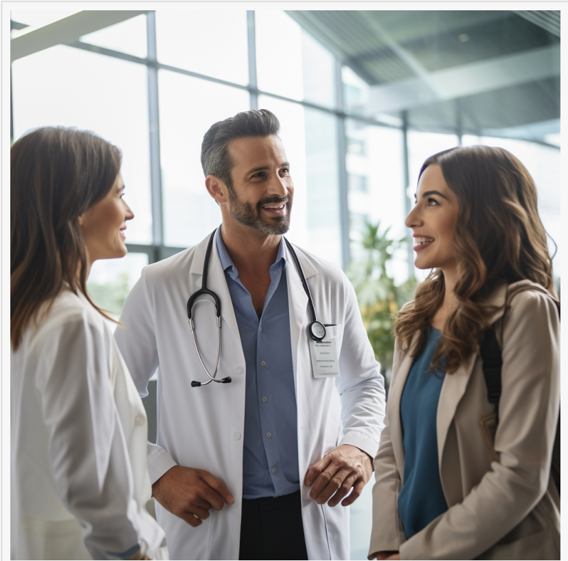
Doctors at the Immunotherapy Institute provide CAR T Cell Therapy for US patient