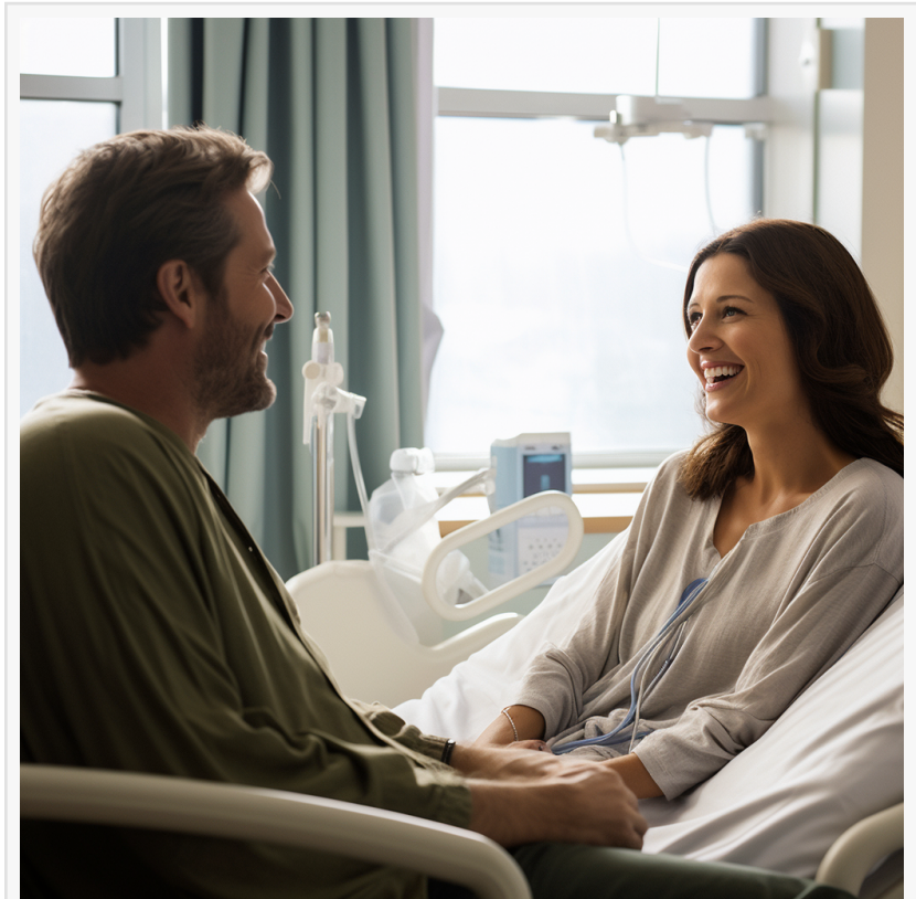
Texas couple travels to Mexico for CAR T-Cell therapy

"After encountering multiple roadblocks and dead ends in our pursuit of CAR T cell therapy in the United States, we were overjoyed to discover the Immunotherapy Institute in Mexico," expressed