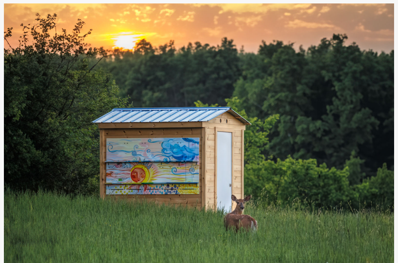
EZHouse Deluxe @ Leystone Farms in Luskville Quebec, mural painted by Iris Kiewiet, photo credit Cindy Mulvihill Photography