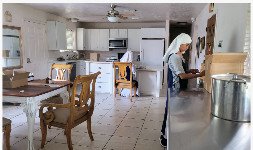
Making CBD and mushroom coffee products.

All of the gelcaps have CBD, but the ‘plus’ line has more raw compounds known to promote recovery, good health, and resiliency. The CBN has more of the cannabinol, that occurs naturally