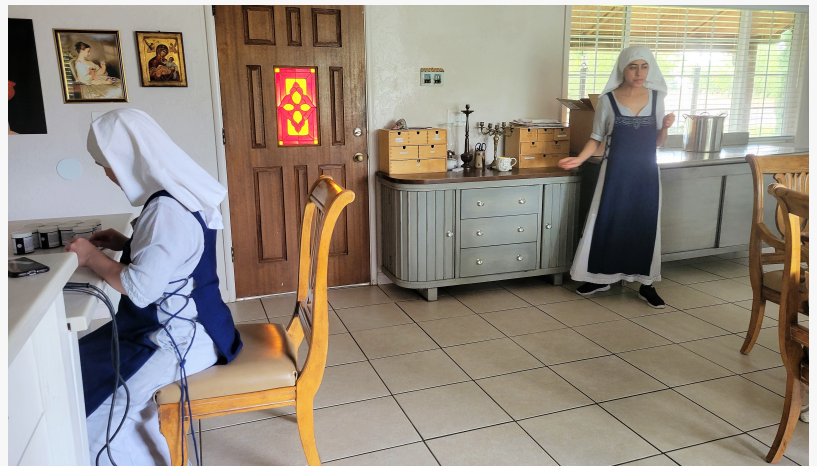
One sister is labeling and the other is organizing the batch for movement to shipping.