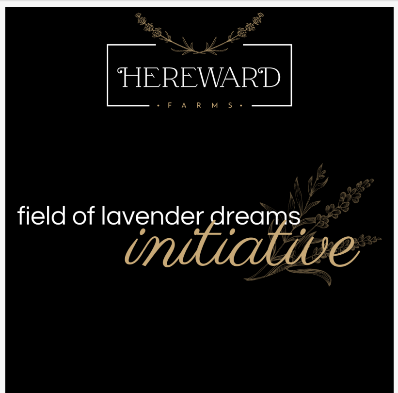
Field of Lavender Dreams Initiative at Hereward Farms

Hereward Farms has a strong legacy of community support, raising over $10,000 for community events and fundraisers since launching the brand Hereward Farms on their 150-acre farm. Signature events like their annual Lavender Festival have made a considerable impact, with last year's festival raising nearly $5,000 for the Alzheimer Society of Dufferin County. The farm has also been a consistent supporter of local charitable organizations such as Believe Bags, The Family Transition Place, Youthline, and Celebrate Your Awesome, to name a few.