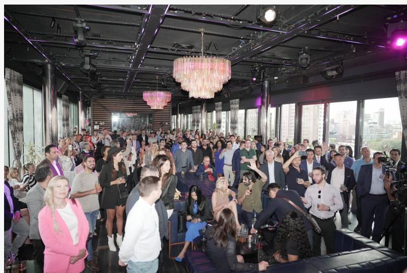
Red Connect Crowd at Crescendom Event

This press release can be viewed online at: https://www.einpresswire.com/article/641817995