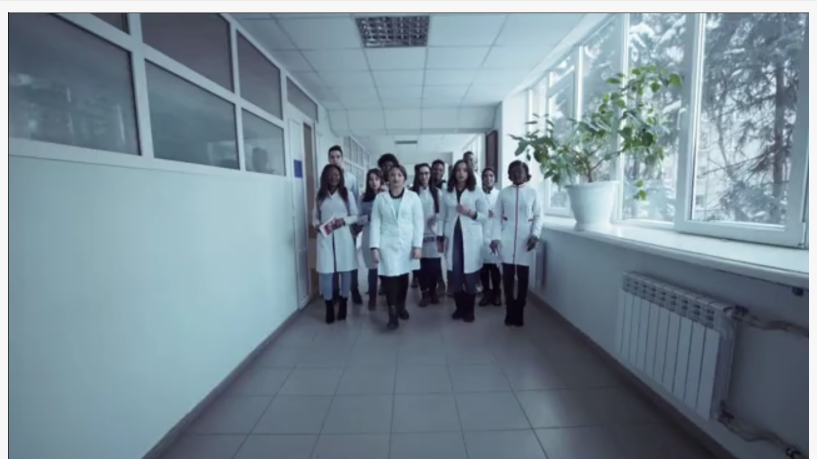
Irving health Insurance

mentions unfavorable projections for Medicaid over the next few years. The most significant takeaways suggest that Medicaid enrollment will decline significantly within the next two years, and the majority of individuals who lose Medicaid will eventually transition to employer coverage.