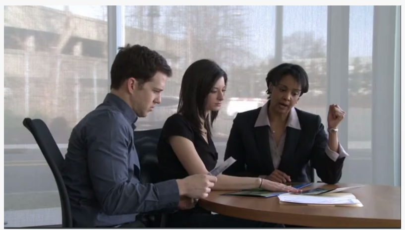
Health Insurance Irving