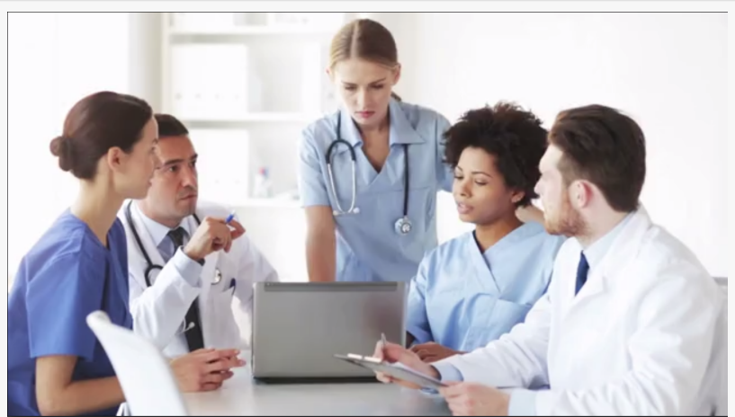
Affordable Health Insurance Irving TX

This press release can be viewed online at: https://www.einpresswire.com/article/641833491