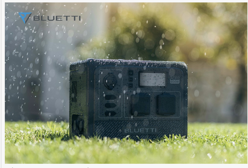
Bluetti AC60 on sale

Though there are many power stations of all sizes on the shelves. Small units hold less energy. Large ones are hard to move. What about something that is mobile and also has a customizable capacity for any scenario?