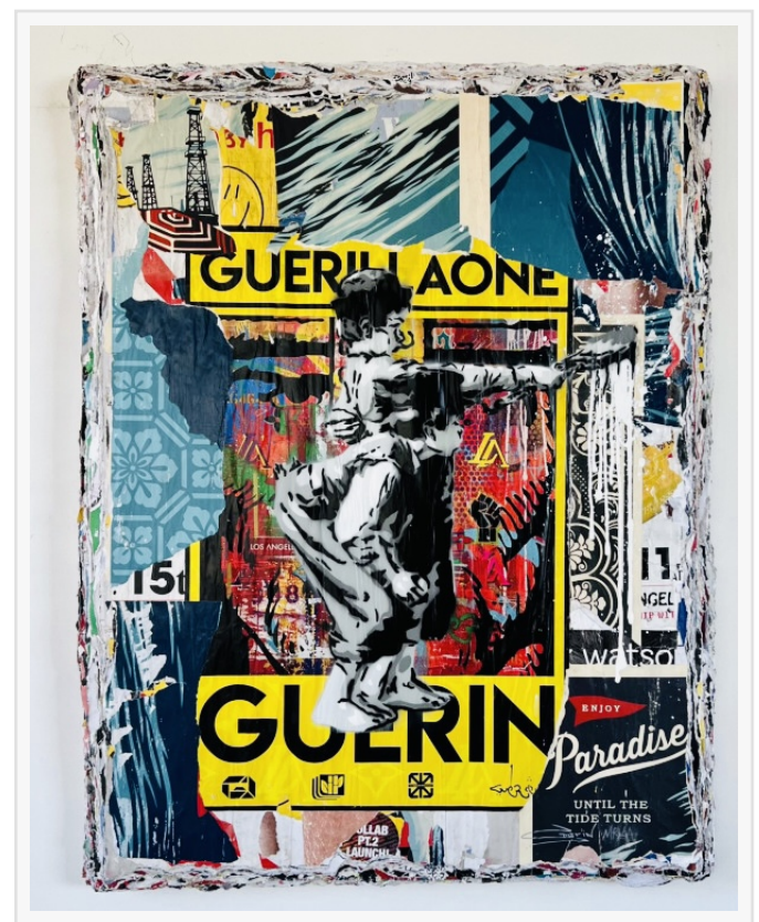
Guerin, "LA Boyz," 52 x 40 inches, mixed media. https://www.luriegallery.com/

Todd Gray, known for his work in photography, sculpture, and performance art, explores themes of identity, race, culture, and memory.