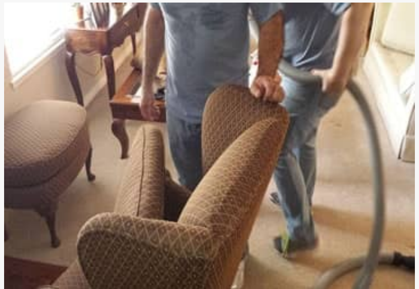
Upholstery Cleaning Wing-Backed Chair