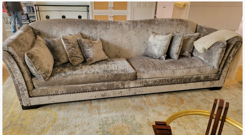
Upholstery Cleaning Santa Monica