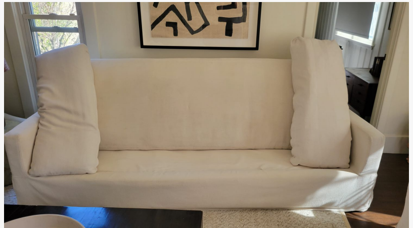
Encino Upholstery Cleaning

Upholstery cleaning refers to the process of removing dirt, stains, allergens, and odors from upholstered furniture such as sofas, chairs, and ottomans. It involves various techniques and methods to ensure a thorough and effective cleaning, restoring the beauty and freshness of all types of furniture.