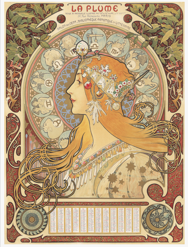
Alphonse Mucha, Zodiac, 1896 (est. $17,000-$20,000).