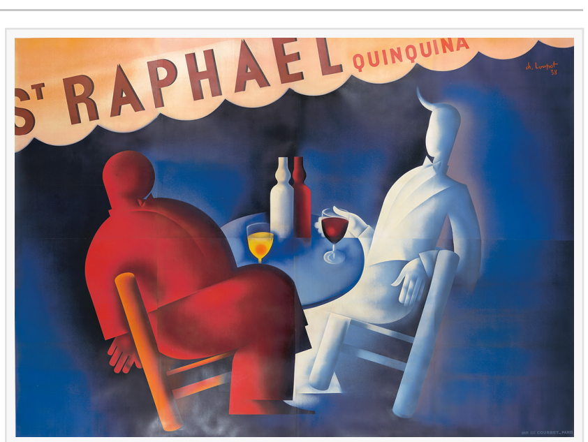
Charles Loupot, St. Raphaël / Quinquina, 1938 (est. $50,000-$60,000).

NEW YORK CITY, NY, UNITED STATES, June 28, 2023 /EINPresswire.com/ -- The 90th Rare Posters Auction from Poster Auctions International on Tuesday, July 18, features rare and iconic images from a century of poster design. The collection includes Art Nouveau, Art Deco, Modern and Contemporary lithographs, as well as decorative panels, maquettes and original works.