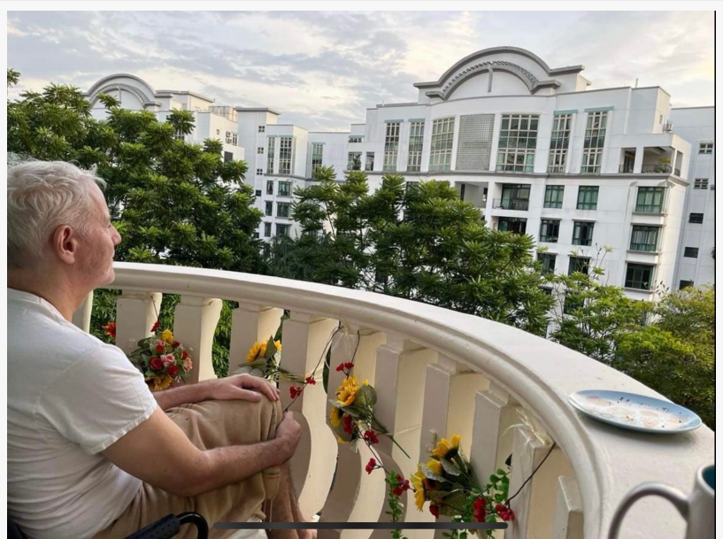
The Sky's The Limit

MIAMI, FL, UNITED STATES, June 28, 2023 /EINPresswire.com/ -- The concept of traditional tutoring has changed radically within the last couple of years. Being physically present in a classroom isn't the only learning option anymore — not with the rise of artificial intelligence (AI) and new technologies, at least. Nowadays, students have access to a quality online tutoring whenever and wherever they want, as long as they can get access to the internet. We are now entering a new era — the merger of AI and online tutoring.