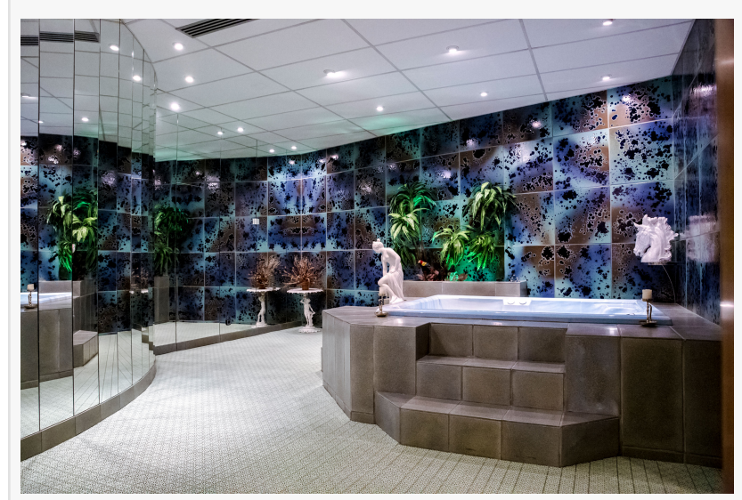
Hot Tub Jacuzzi and Turkish steam room with His and Hers Shower room

As part of Concierge Auctions' Key for Key<sup>®</sup> giving program in partnership with Giveback Homes, the closing will result in the funding towards a new home built for a family in need.