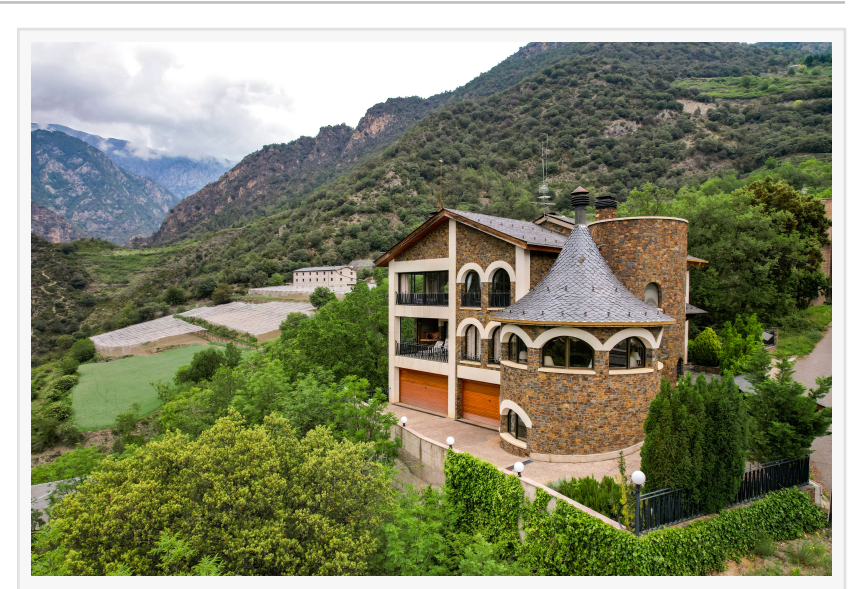
Casa Comprar, a Luxury Mountain Chalet in The Pyrenees Mountains of Sant Julià De Lòria, Andorra

NEW YORK, NEW YORK, UNITED STATES, June 29, 2023 /EINPresswire.com/ -- Offering four-season Pyrenean delights, the luxurious mountain villa <u>Casa Comprar</u> blends into its scenic natural setting, built for effortless entertaining. Listed for €3.5 million, the property is scheduled to auction with a €1.25 million Reserve next month via Concierge Auctions in cooperation with