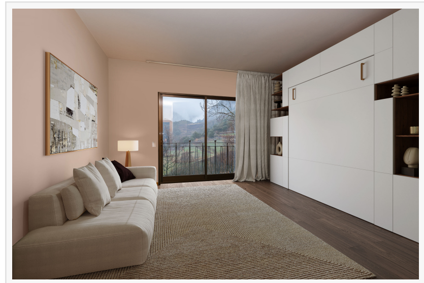
Four levels of spacious areas for effortless entertaining

Casa Comprar is available for showings daily 1-4PM and by appointment, in person or virtually.