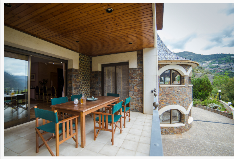
Terrace with sweeping views of the Sant Julià valley

Other notable features include a natural stone exterior and oversized windows for abundant natural light; five total bedrooms and four bathrooms; a chef's kitchen complete with a butler's pantry, eat-in breakfast area and walk-in pantry, custom cabinetry, natural Granite countertops, and slab backsplash; a top floor primary suite with expansive views, a sitting room, Rose Marble spa bathroom with soaking tub, double vanity, glass shower, 24kt Gold plated taps, a custom walk-in closet, and private home office; entertaining areas, including a formal dining for up to 20 people, a second living room, bar, wine cellar, gym, billiards-Snooker and table