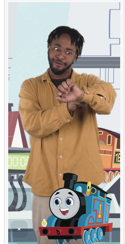
Weyo Books Thomas Tank Engine