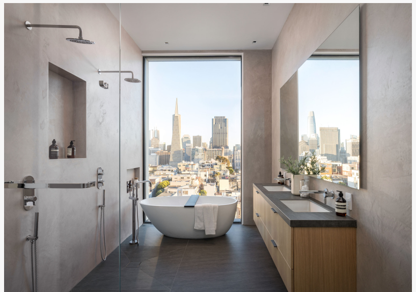
Four-level modern home with breathtaking views of the Bay