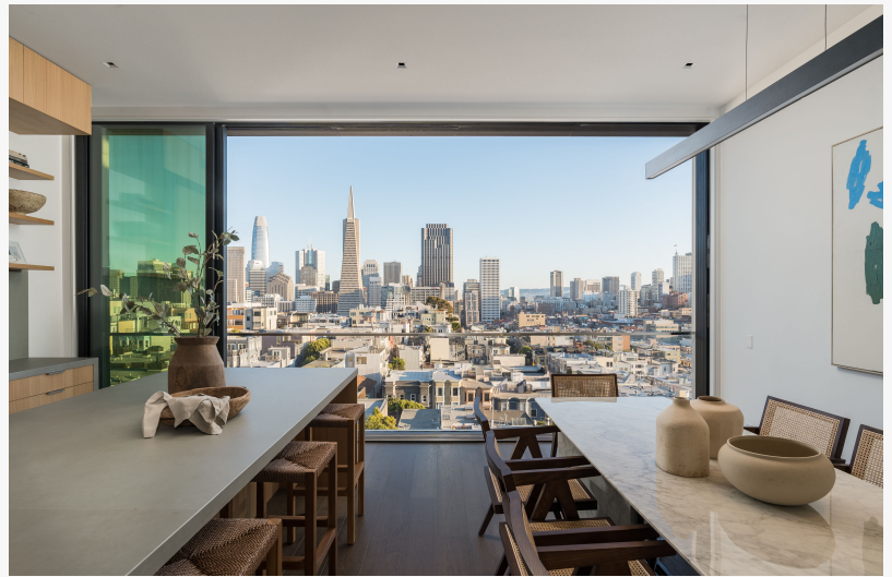
Four-Level Mansion Overlooking Telegraph Hill | San Francisco, CA