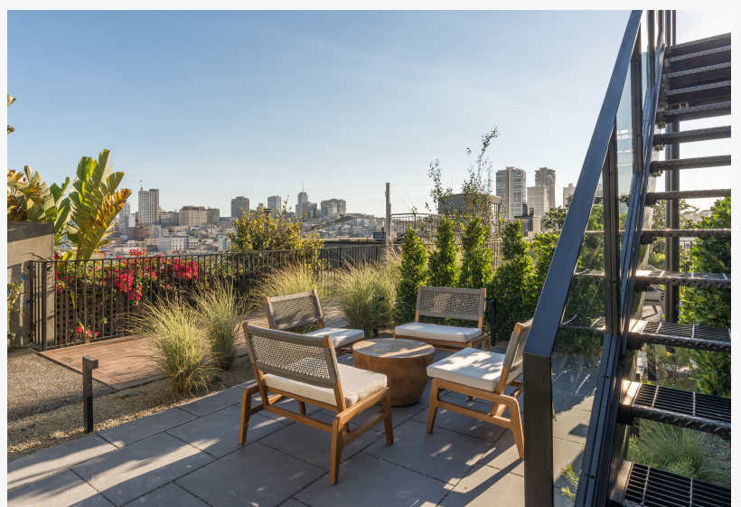
Massive rooftop deck with glass railings and panoramic views

Sotheby's International Realty listings and companies, Concierge Auctions provides Sotheby's brand exclusivity as Sotheby's Concierge Auctions. Since inception in 2008, the firm has generated billions of dollars in sales, broken world records for the highest-priced homes ever sold at auction and conducted auctions in 46 U.S. states and 36 countries. The firm owns one of the most comprehensive and intelligent databases of high-net-worth real estate buyers and sellers in the industry, and it has committed to build more than 300 homes through its Key For