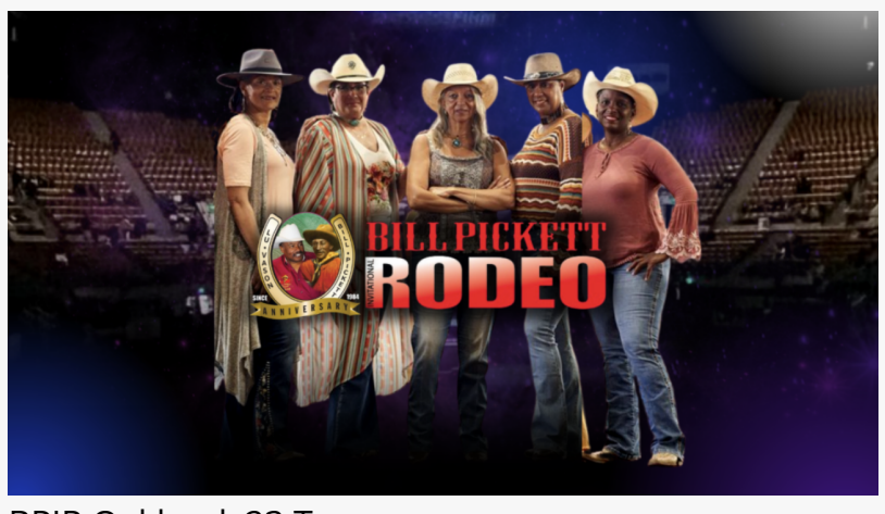
BPIR Oakland, 23 Team