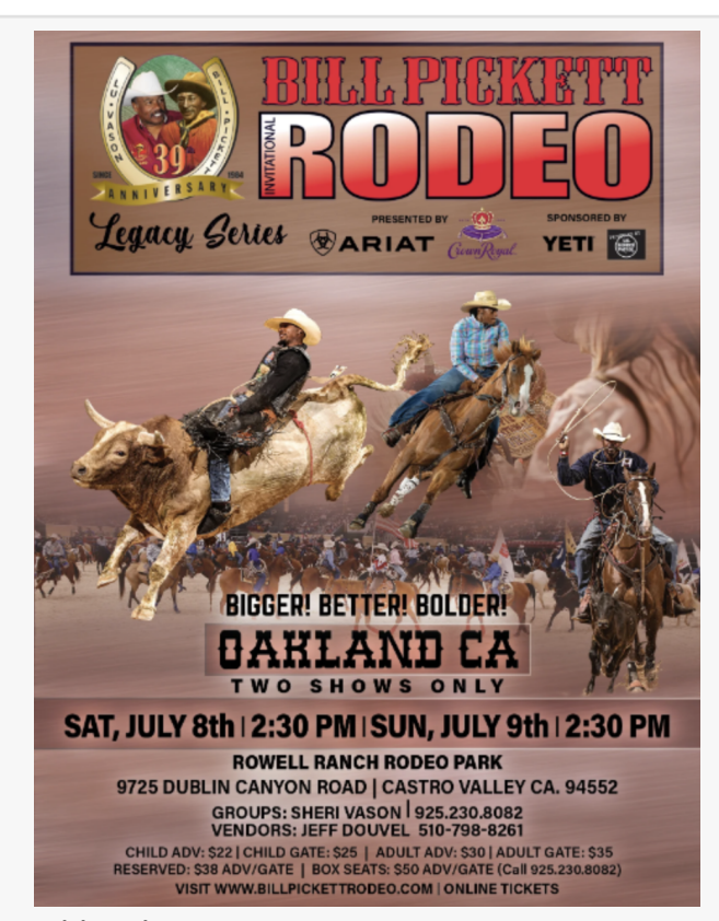
BPIR Oakland, 23

The BPIR has a long legacy and in 2021, BPIR was televised on CBS National Broadcast, the first and only African American Rodeo to air on a major network reaching millions of 1st time viewers. This was extremely historical because CBS aired on Juneteenth '21, the first year Juneteenth became a National Holiday. This was truly a major endeavor that BPIR was most