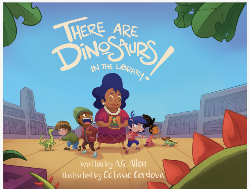
Dinosaurs in the Library Cover

There Are Dinosaurs in the Library! is a richly illustrated and thrilling picture book for children ages 4 to 10. In the book, a teacher of color named Mrs. Barker wants to take her third-grade class to the library. When a blue-haired student name Alyssa objects, she is only convinced when Mrs. Barker whispers there will be dinosaurs in the library.