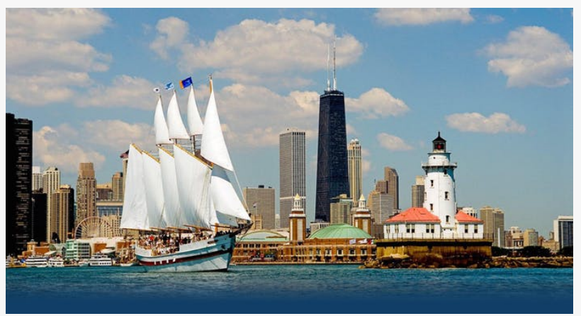
Tall Ship Windy of Chicago, Sailing Into Lake Michigan

For more information about Amphitrite Digital's tours and activities, visit www.AmphitriteDigital.com .