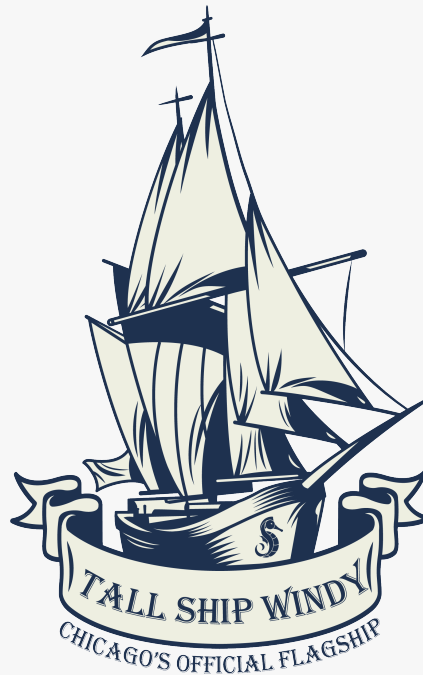
Tall Ship Windy

Windy is certified for 150 guests on its three decks: the fore deck, midship deck and aft deck. Guests can sail any day of the week from May until mid-September with a minimum of four sails offered daily and additional programming offered Mondays, Wednesdays, Saturdays and Sundays.