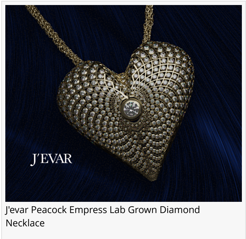
J'evar Peacock Empress Lab Grown Diamond Necklace

This press release can be viewed online at: https://www.einpresswire.com/article/642774615