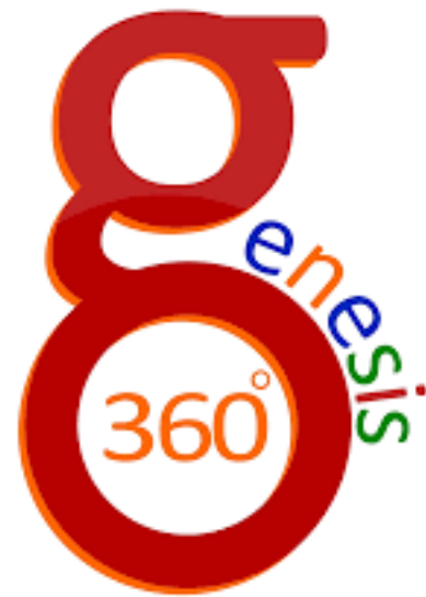
Genesis 360, LLC, is a veteran-owned maintenance, construction, and IT service company.

Genesis 360, LLC was also named one of INC 5000's fastest-growing companies in America in 2022.