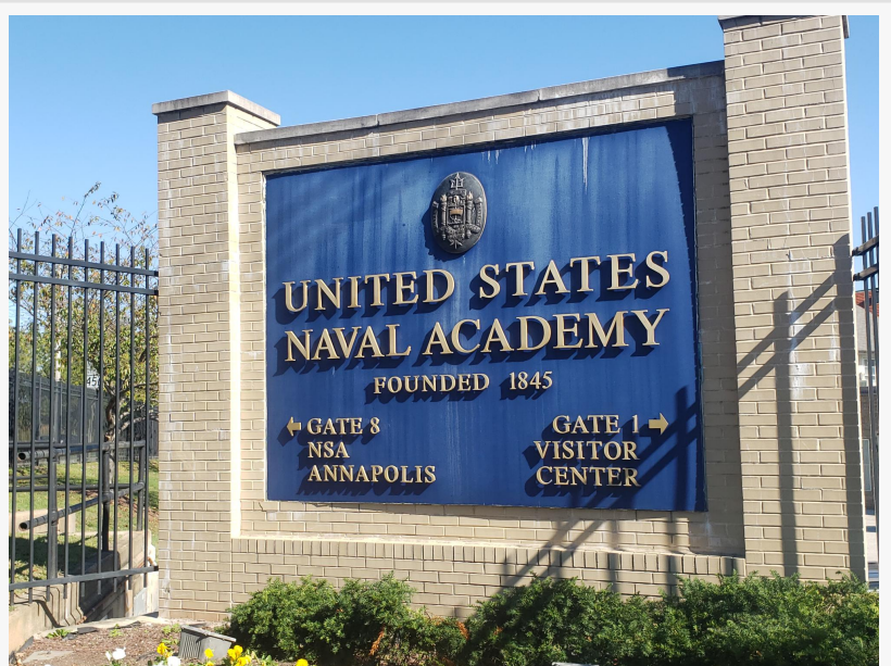
Genesis 360, LLC was recently awarded a $16 million dollar contract from the U.S. Naval Academy for grounds maintenance and landscaping services.

offers multiple divisions handling a variety of services, from landscaping and janitorial services to