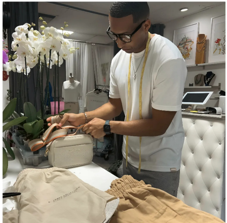
Meet the Designer