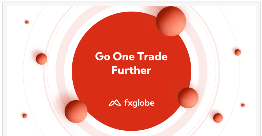
One trade further with FXGlobe